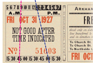
E.G.: tear here indicates transfer expires at 9:45 am